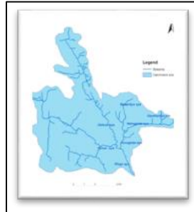
Map of Pinga-Oya catchment