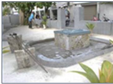
An artisanal well in Maldives

Web: www.climate.lk www.tropicalclimate.org