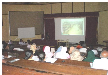
Symposium on Pinga-Oya.