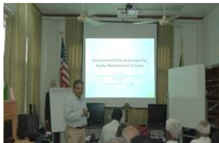
PI at awareness program organized by USAID in Kandy